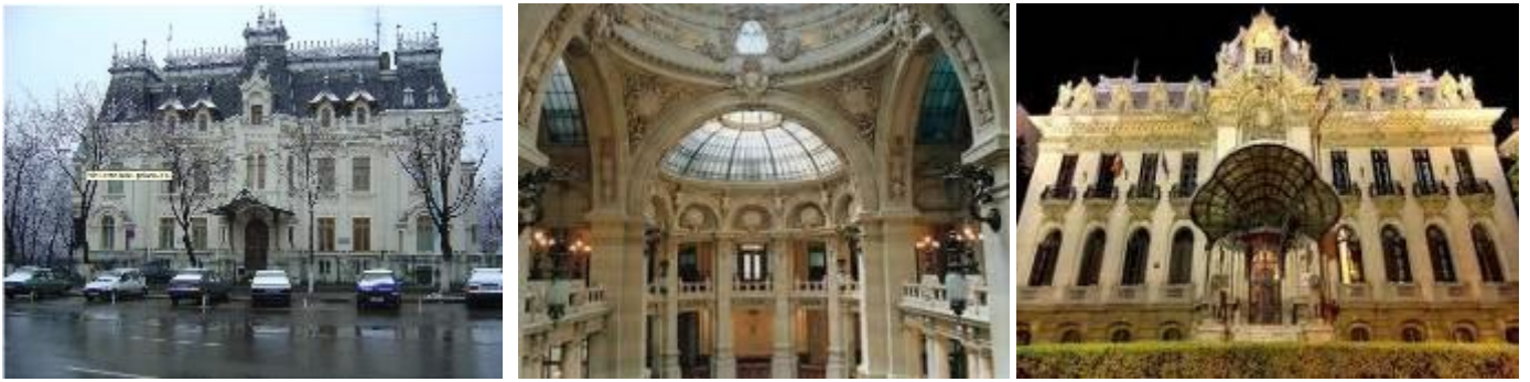
Some of the beautiful palaces of Bucharest: The Cretulescu Palace and the Cantacuzino Palace (George Enescu Museum)