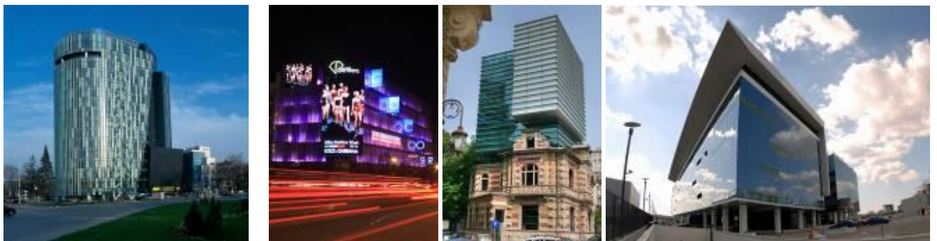
Some modern architecture