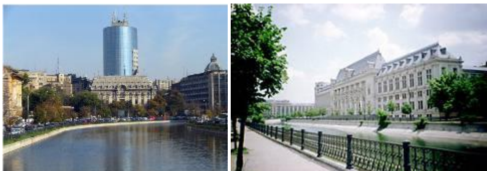
The Dambovitza River

Revolution Square (Piata Revolutiei) - The square gained worldwide notoriety when TV stations around the globe broadcasted Nicolae Ceausescu's final moments in power on December 21, 1989. On the far side of the square stands the former Royal Palace , now home to the National Art Museum (that includes a roomful of early sculpture of Romanian sculptor Brancusi ), the stunning Romanian Athenaeum and the historic Athenee Palace Hotel .